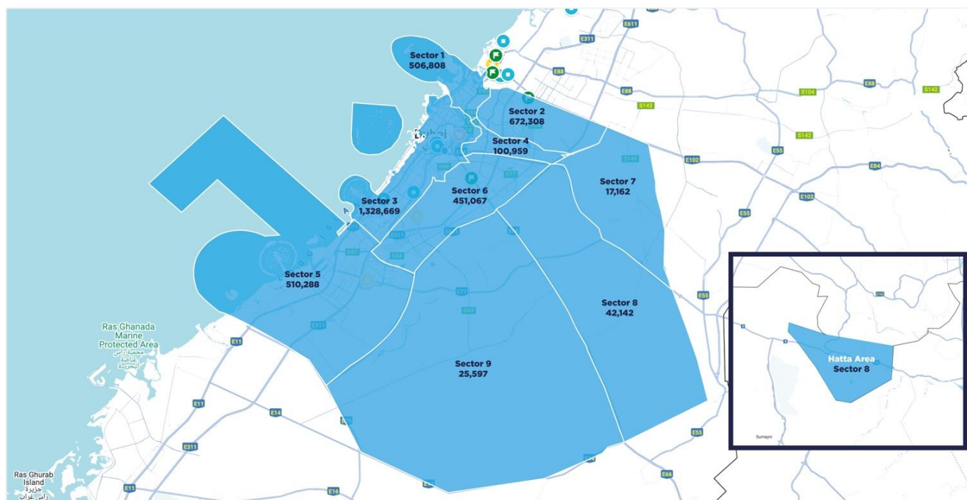
Figure 3 - Dubai Population Map by Planning Sectors- End of 2023